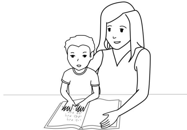
Figure 1. Sighted adults reading with visually impaired children, as depicted here, is commonly how “co-reading” and “visual impairments” are conceptualized together. Rarely are needs of blind adults and sighted children considered in the design of interventions. 1

reading [37], and even redefine the role of literacy for future generations [8]. Co-reading – when parents read aloud with their children – has been shown to be an effective activity for developing literacy skills and interests in young children [57]. HCI has begun to explore how digital technologies might support co-reading (e.g. [17,18,72,73]). Yet, there has been little empirical work toward identifying how and why parents co-read, or understanding the cultural significance of co-reading as an activity. Here, we contribute to this growing body of work, by examining the practices used in, and significance of, co-reading amongst people with visual impairments (PWVI) and their children. 1